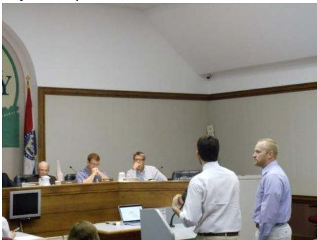
(The owner of Rainbow Community Pre-school makes his pitch to the P&Z Commission)

HOURS OF OPERATION: The “school” would be open much longer than a public school. Drop offs would be from 7-to-9:15 and pickups would be from 3-to-6. In other words this “school” would be open 11 hours. It truly was looking more and more like a day care operation.