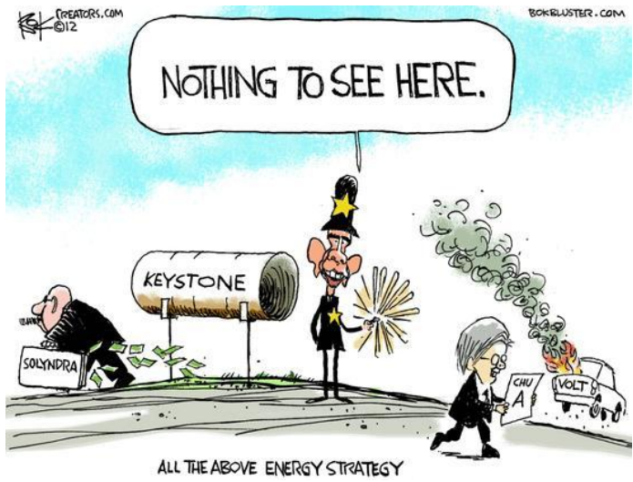
ALL THE ABOVE ENERGY STRATEGY