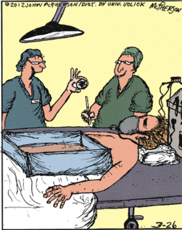
"This guy is a lobbyist for HMOs. Let's leave this half dollar in him so metal detectors go nuts anytime he walks through them."